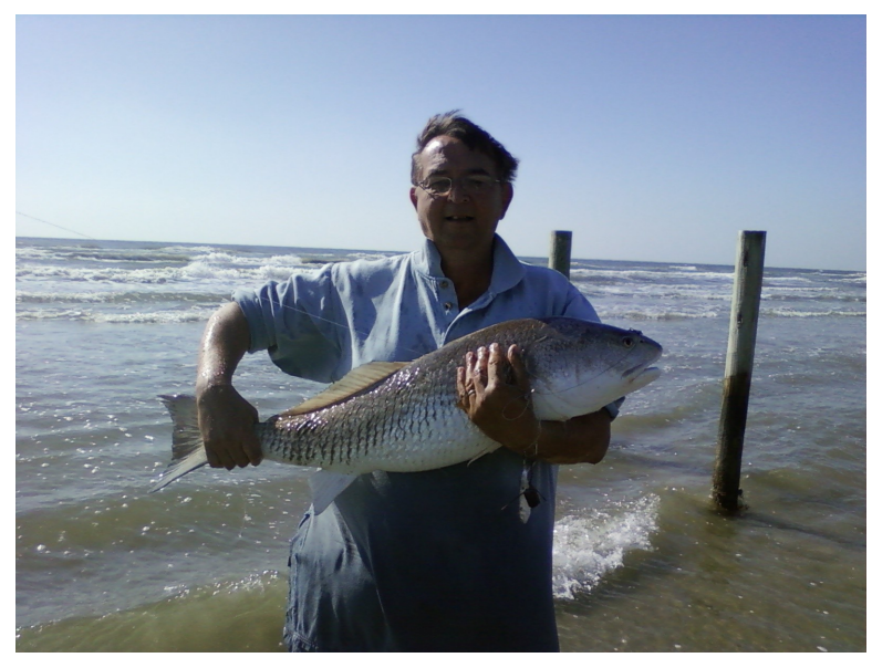
Your humble editor even lucked into a nice red in the surf.