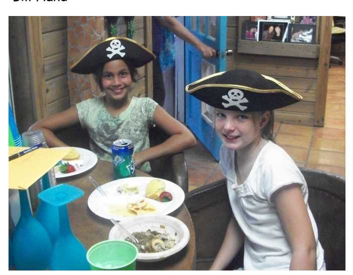
Did you hear about the Labor Day Treasure Hunt? See page 4