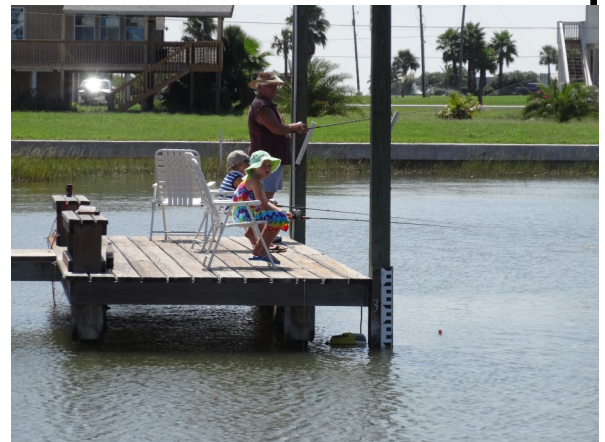
Teaching them young!

With all the rain that we have had in the past two weeks, the shrimp should be heading out into the bay. Now is the time to have a set of binoculars on every trip. Scan the horizon for working sea gulls diving for bait and you will find Specks, Reds and of course those pesky Gafftop under them. Please don't just run right up in the middle of the birds. If another boat is already fishing those birds, then keep your distant or look for other birds. The nice thing about our end of the bay is that it rarely gets too crowded with boats chasing birds.