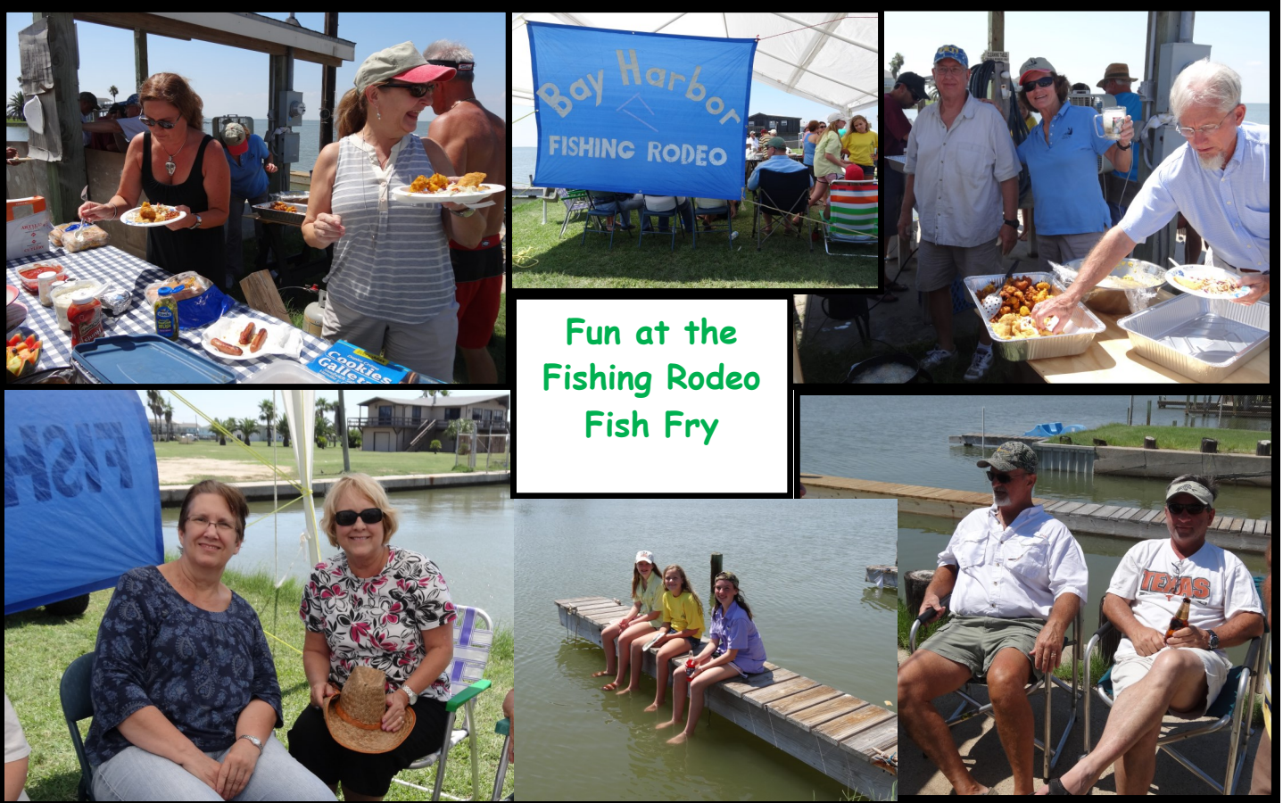
Fun at the Fishing Rodeo Fish Fry