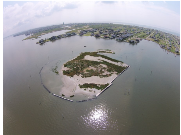
Our island 8-14-14

It's hard to believe but the Bird Island restoration is almost four years old. The parent group in charge of the project, "Restore America's Estuaries" has asked for the opinions of Bay Harbor residents regarding the impact of the work on our community.