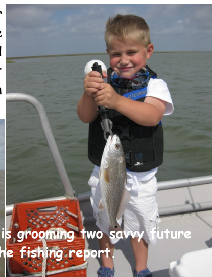
We're glad to see Cap'n Bill is grooming two savvy future contributors to the fishing report.