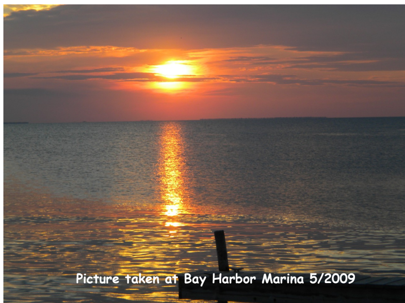
Picture taken at Bay Harbor Marina 5/2009