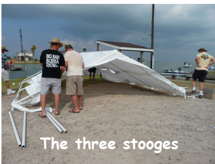
The three stoges