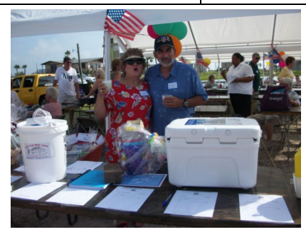
Annual Meeting Margaritas in hand, attendees view the treasures offered for auction.