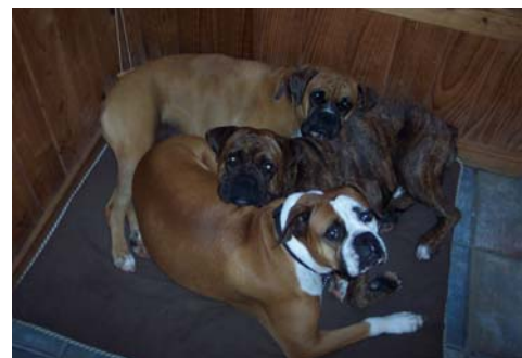
Spice, Rhino and Ginger

I look forward to hearing some of the other stories in the neighborhood and welcome any comments on how we can be better neighbors.