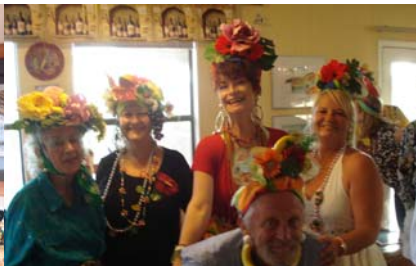
Local chapter of Carmen Miranda fan club. President in foreground.