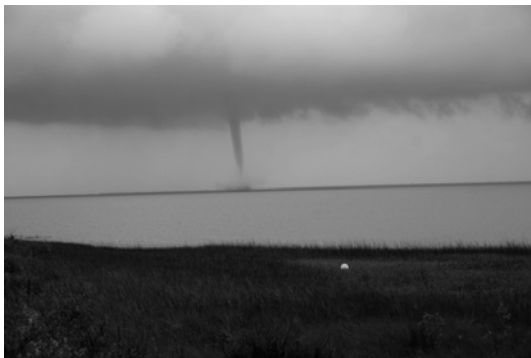
Waterspout seen in Bay north of Bay Harbor Sunday, April 27th