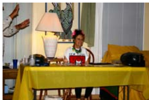
The DJ formerly known as Toy

More and Better Quality pictures of the party are on our website at www.bhiatx.org