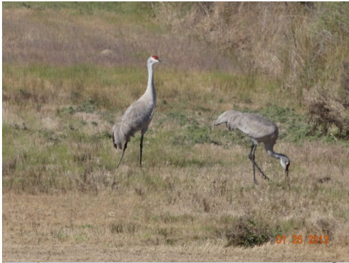
Sandhill Cranes spotted on 1st Street.