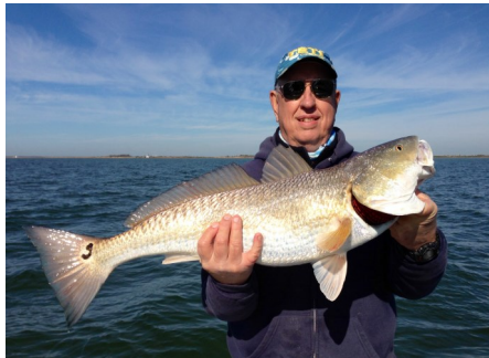
Redfish...A Great Catch !!