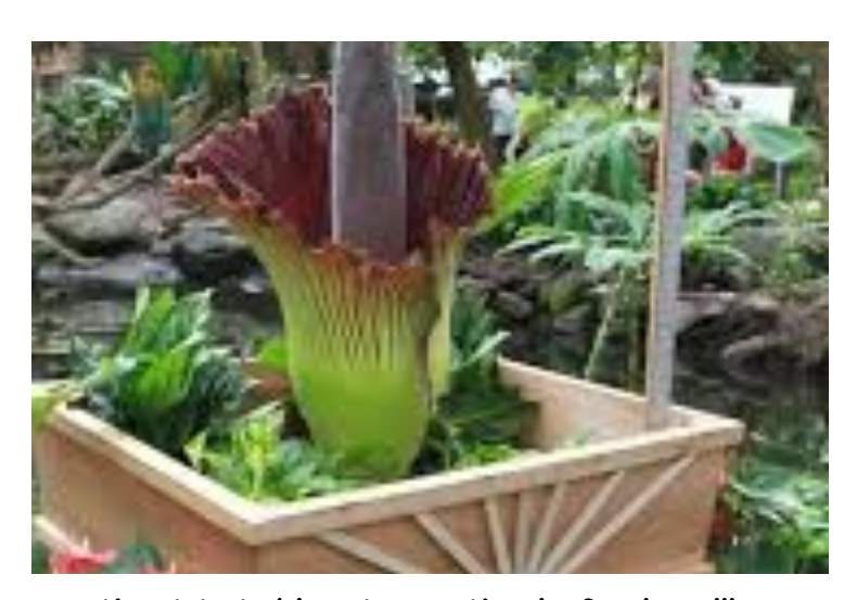
Morticia is blooming at Moody Gardens !!!

Other events being considered this year: